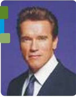
Arnold Schwarzenegger Governor of California

The world knows Arnold Schwarzenegger as a famous bodybuilder and a Hollywood action hero, but he is also a successful businessman, generous philanthropist and California's 38th Governor.